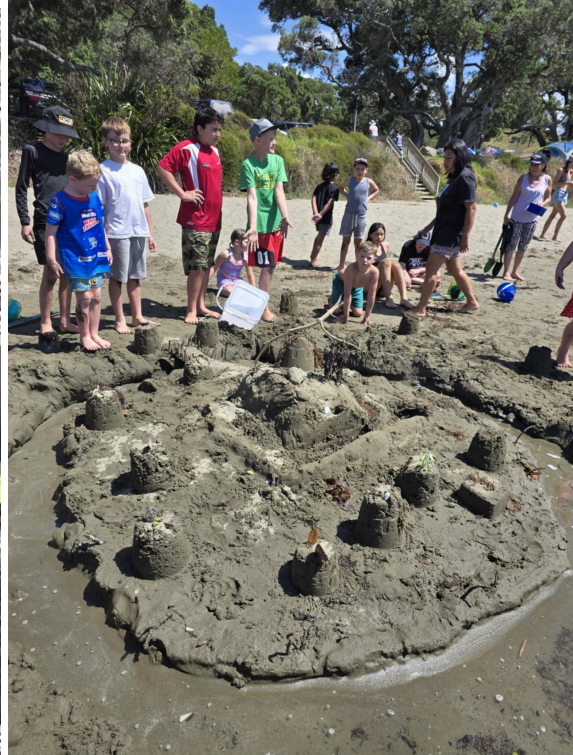
Sand Castle Competition, Beach Day